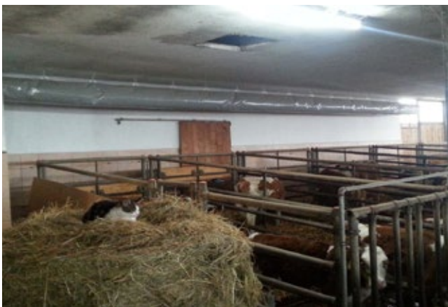
Installation in a young cattle barn

The SOFTAIR hose ventilation system provides for extra ventilation and, as dynamic overpressure ventilation, a cost-efficient yet effective way of improving the fresh air intake for poorly ventilated stable partitions. The range of application of the SOFTAIR hose ventilation system also includes a temperature comfort ventilation for cooling, which is of great importance for maintaining the well-being and health of the animals, especially in the summer months.