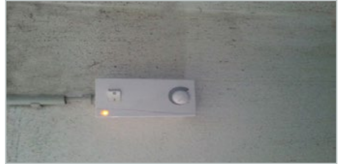
Speed control ventilator system