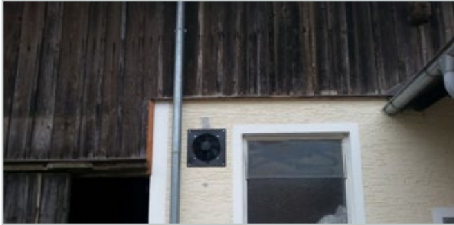
Outside example - supply air fan